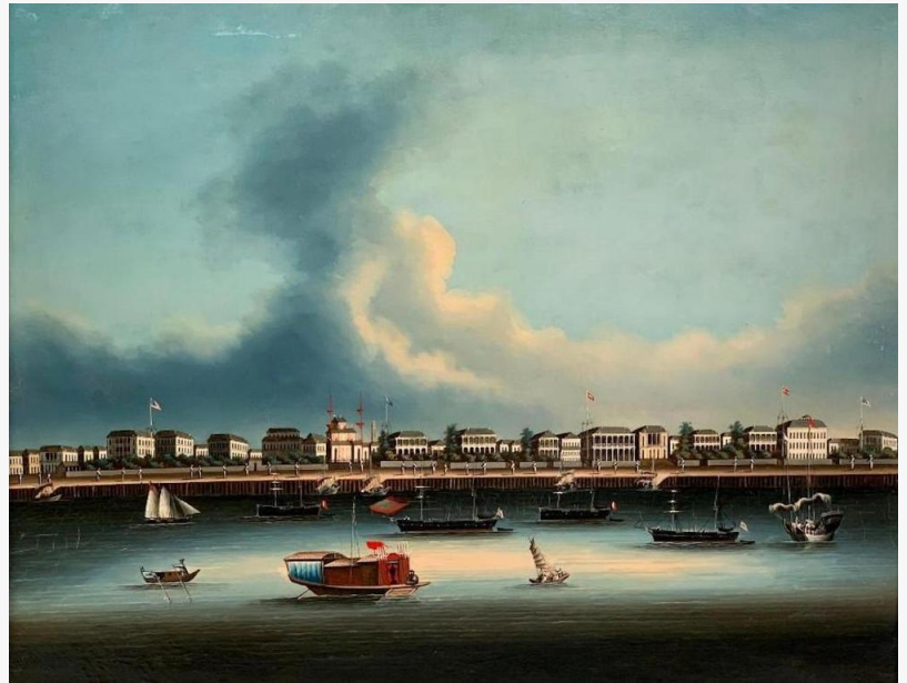
19th century oil on canvas China Trade painting titled The Bund at Shanghai (circa 1850-55), unsigned and framed, 17 ¼ inches by 23 inches (canvas, less frame) (est. $3,000-$5,000).

The battle for top lot honors could come down to a contest between a vase and a pair of bronzes. The baluster form vase by Paul Francois Berthoud (French, 1870-1939), titled Femme