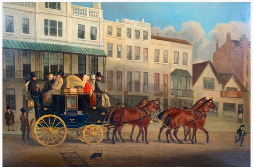
Oil on canvas painting by the late 19th century British artist H. D. Williams, titled The Magnet Coach , 29 inches by 41 inches (as framed), signed (est. $2,000-$4,000).