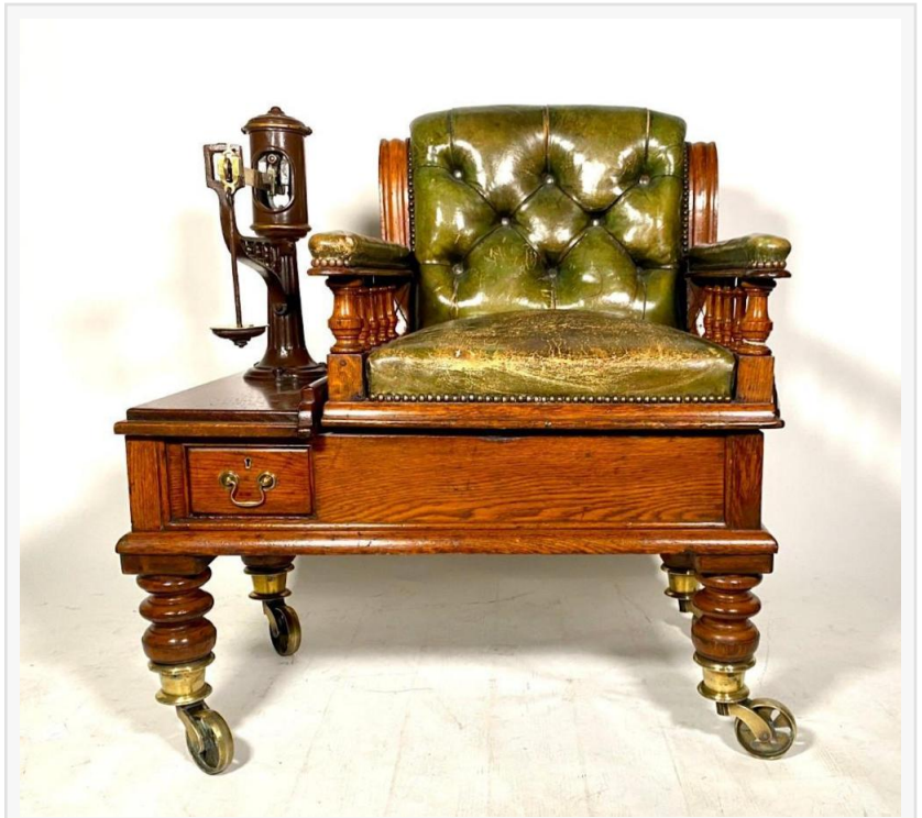
19th century English Regency (or Victorian) oak jockey scale, incorporating a leather upholstered seat with a tufted back over upholstered arms and seat (est. $2,000-$4,000).

Cynthia Maciejewski Neue Auctions +1 216-245-6707 email us here