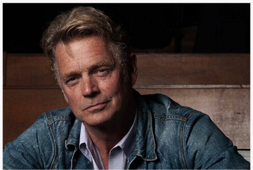
John Schneider from "the Dukes of Hazzard" and "Smallville".