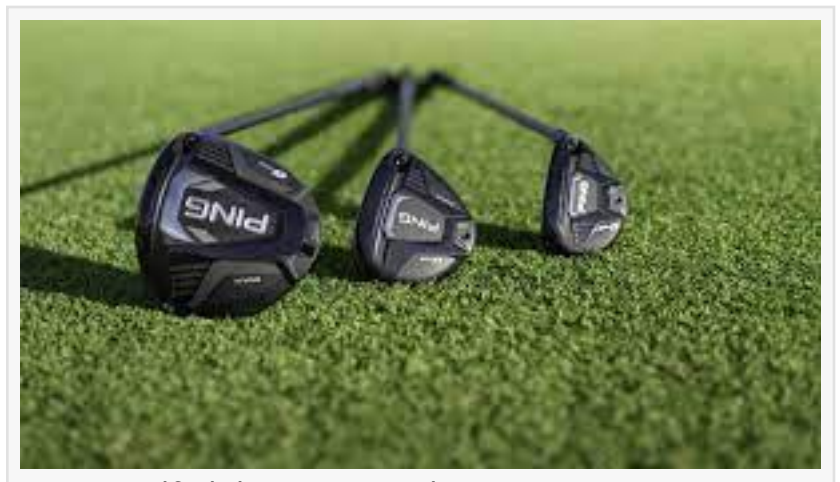
Smart Golf Club Buyers Mailing List

Sprint Data Solutions Worldwide Marketing started first with a local service range, only its hometown of Las Vegas, Nevada. Today, the service range covers the entire United States, including the states of Alaska and Hawaii. Crossing the borders is also an option for businesses wanting to approach Canada or Mexico. For those businesses ready to enter the international arena, lists are available that cross the Atlantic and give access to European Union countries like