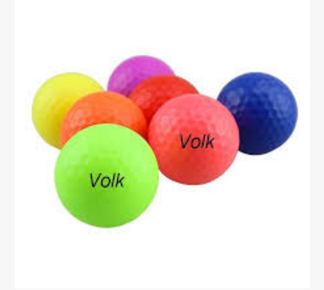
Specialty Golf Ball Buyers of Canada and the US