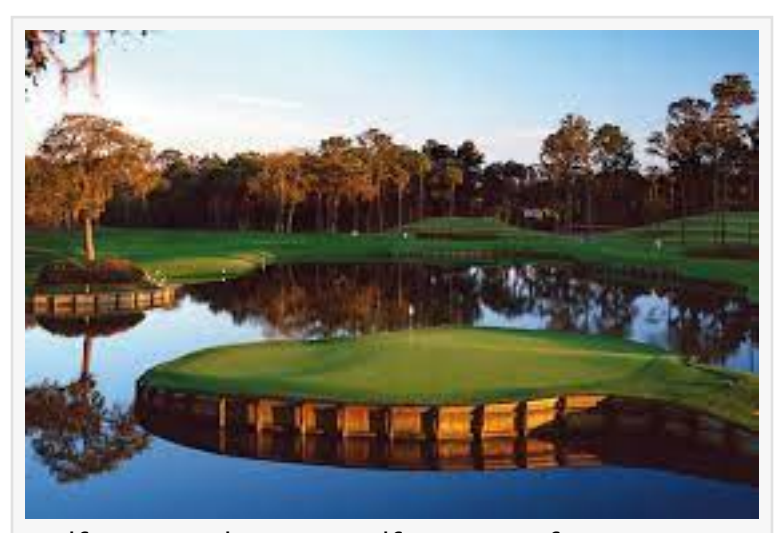
Golfer From the TOP Golf Course Of US & Canada

Sprint Data Solutions Worldwide Marketing was the dream of a disabled veteran. Having finished the responsibilities of military defense, it was decided that the