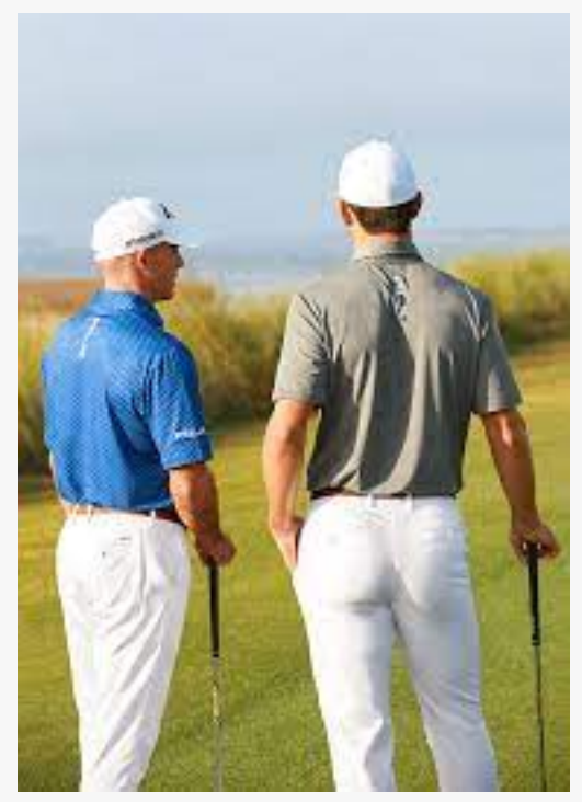
Top Golfers of North America who buy golfing products. Golfing Vacation Packages