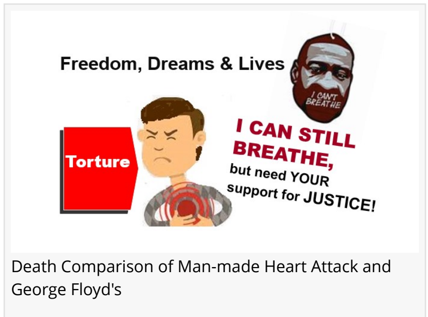
Death Comparison of Man-made Heart Attack and George Floyd's