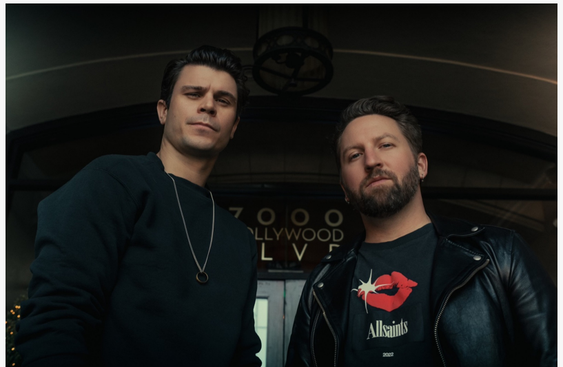
New Medicine

Taking the new single and its bevy of hits on the road, Adelitas Way recently wrapped a 45-show run with Skillet and is currently headlining its 19-city "Rivals" tour featuring special guest Gemini Syndrome. The "Rivals" tour began last month and leads up to an Adelitas Way hometown finale at Hard Rock Live Las Vegas March 25.