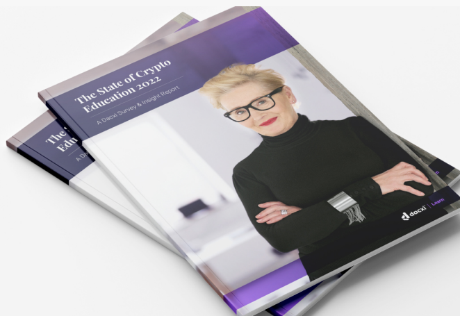
The State of Crypto Education 2022