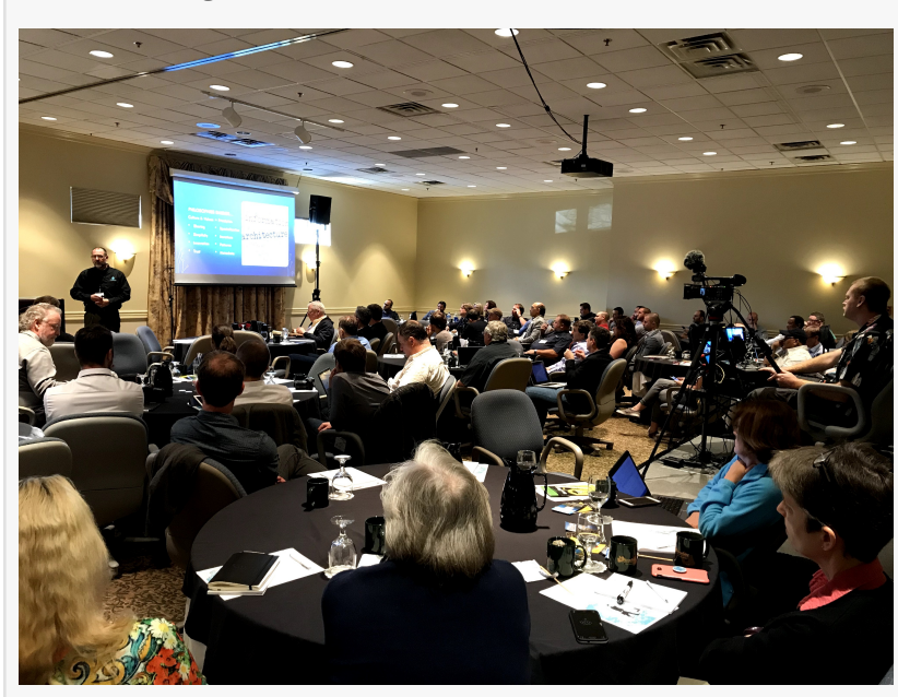
Attendees at a Session