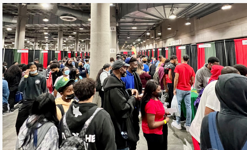
Students patiently wait to connect with recruiters at Black College Expo

college admissions. NCRF's mission is to curtail the high school dropout rate and increase degree and/or certificate enrollment among underserved, underrepresented, at-risk, low resource, homeless, and foster students. NCRF's vision is to close the gap in educational achievement, workforce and economic disparities with the goal to end racism and racial inequalities.