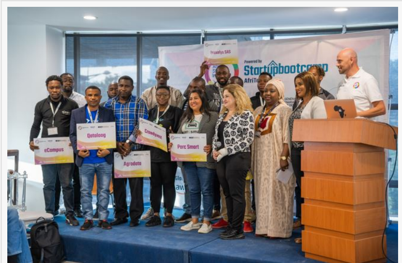
Top 10 Finalists

“Senegal is committed to driving innovation and entrepreneurship across our country so that we can take our place among Africa’s top ten startup ecosystems. For the past four years, we have provided specific support and assistance for startups in the form of finance, incubation and