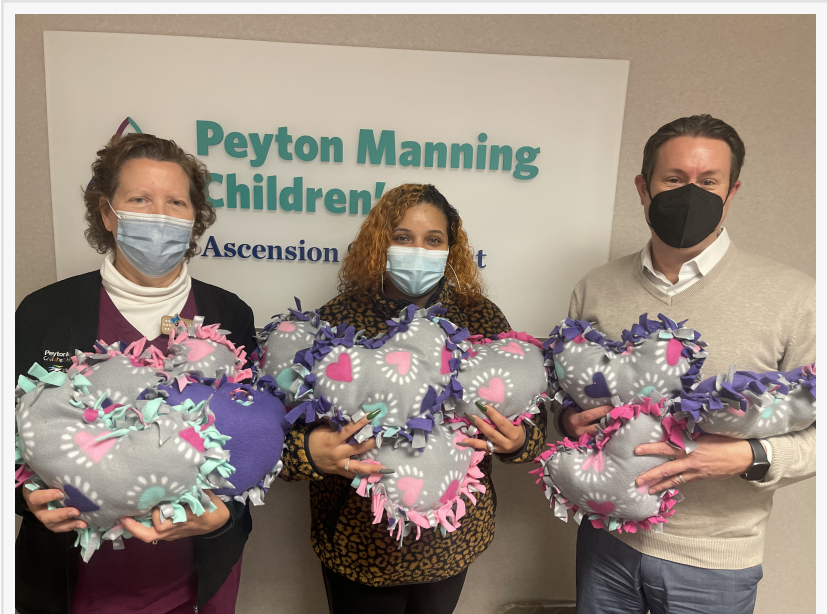
Astral senior living residents donated these pillows to the pediatric heart unit at the Peyton Manning Children's Hospital.