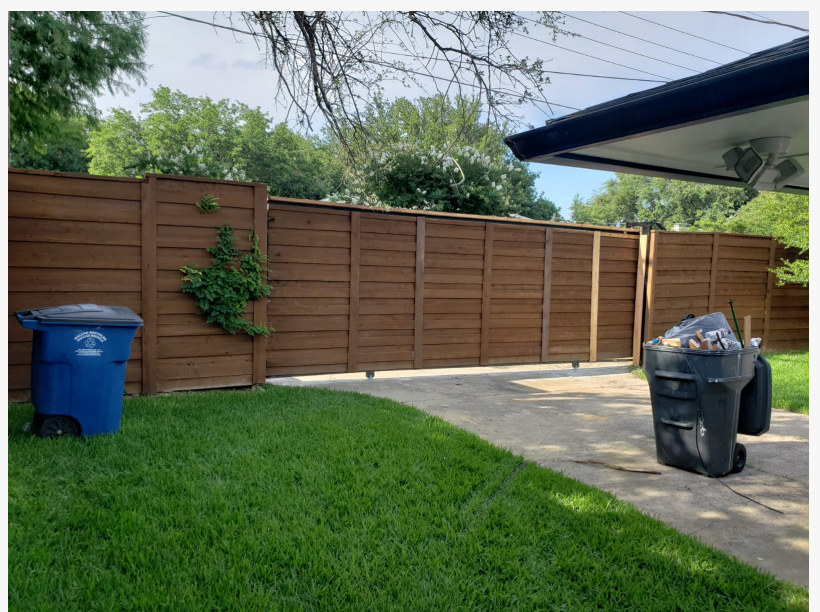
New Wooden Gate

It is important to think well about the right operating system to install and what is required. Always look for the opener that will fit best to the right type of gate, gate's traffic, weather and wind conditions at the area, noise and the option between a quiet hydraulic system or electromechanical systems with more economical option a solar operated gate as well.