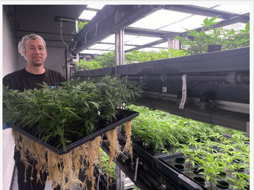
Fully Automated Cloning with the AEtrium-2.1 SmartFarm

AEssenseGrows (pronounced "essence grows"), founded in 2014, is a precision AgTech company based in Silicon Valley. AEssenseGrows provides accelerated plant growth SmartFarm platforms and software automation delivering pure, zero pesticide, year-round, enriched growth to fresh produce and medicinal plant producers globally. With AEssenseGrows, you can precisely control your production operations at your fingertips from anywhere in the world. For more information, visit: https://www.AEssenseGrows.com .