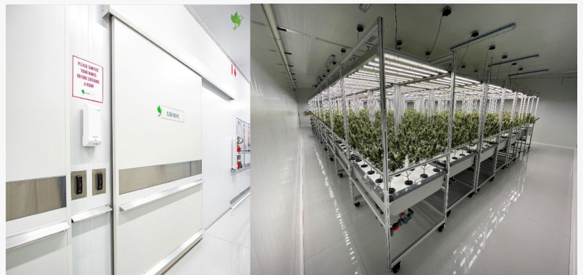
Grow Room Facility – FarmaGrowers, South Africa