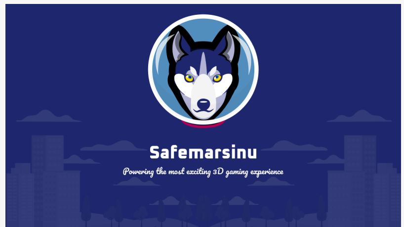
Safemars Inu Logo