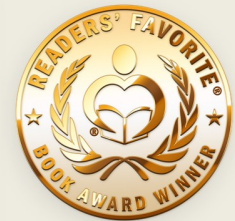
Sane Grace Novel Wins Gold Medal!