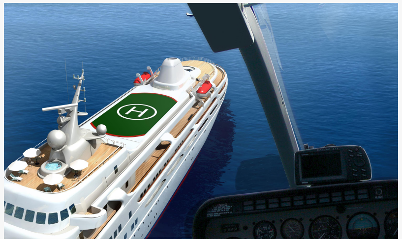
Outfitting by renowned Fincantieri Shipyard Trieste in Italy