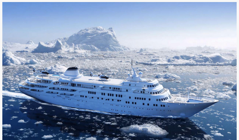
Rare opportunity to design the interior to your taste

“A dedicated team of engineers, architects, and designers are available to make the new owner’s dream a reality,” stated Althaus. “With a significant stage of completion thus far, the predicted delivery from the signature of the contract is just 18 months—significantly less time than 4 to 5 years when starting from scratch.”