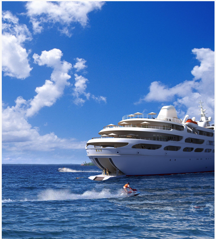
Accommodates up to 36 guests and 50 crew members

About Concierge Auctions Concierge Auctions is the world's largest luxury real estate auction marketplace, with a state-of-the-art digital marketing, property preview, and bidding platform. The firm matches sellers of one-of-a-kind homes with some of the most capable property connoisseurs on the planet. Sellers gain unmatched reach, speed, and certainty. Buyers receive curated opportunities. Agents earn their commission in 30 days. In November 2021, Concierge Auctions was acquired by Sotheby's, the world's premier destination for fine art and luxury goods, and Realty Holdings Corp., the largest full-service residential real estate services company in the United States, holding a joint 80 percent ownership stake.