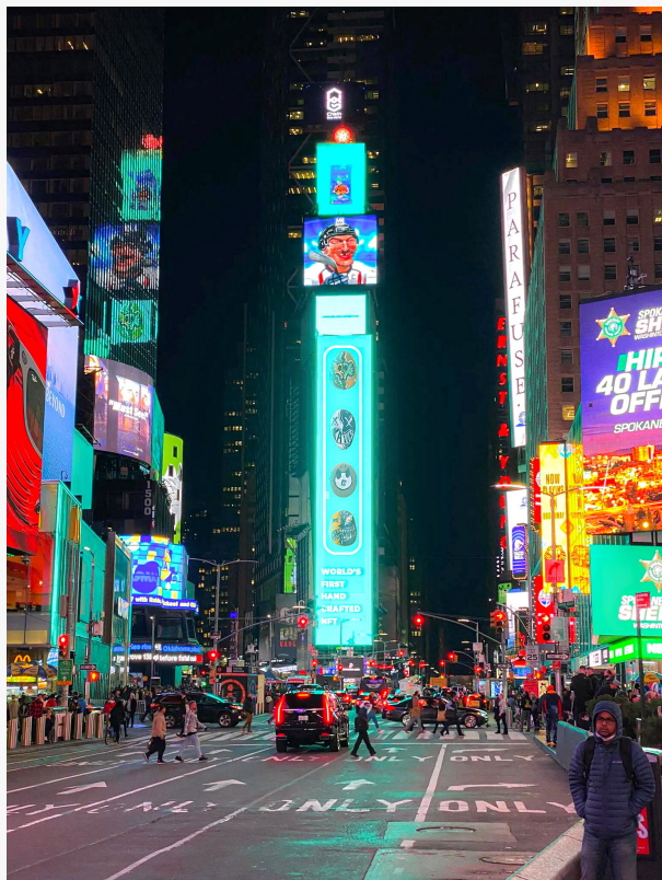
Pebble art turning heads in the busiest alley of the world.