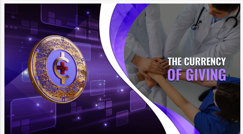
CareCoin; The Currency of Giving

While the focus of most cryptocurrency projects is to maximize profit for holders by serving as viable investment instruments, CareCoin offers the same perks but with the added benefit of being a charity token. The developers have revealed that the new cryptocurrency will donate 2% of every transaction to various humanitarian and socio-economic causes which will be chosen by holders.