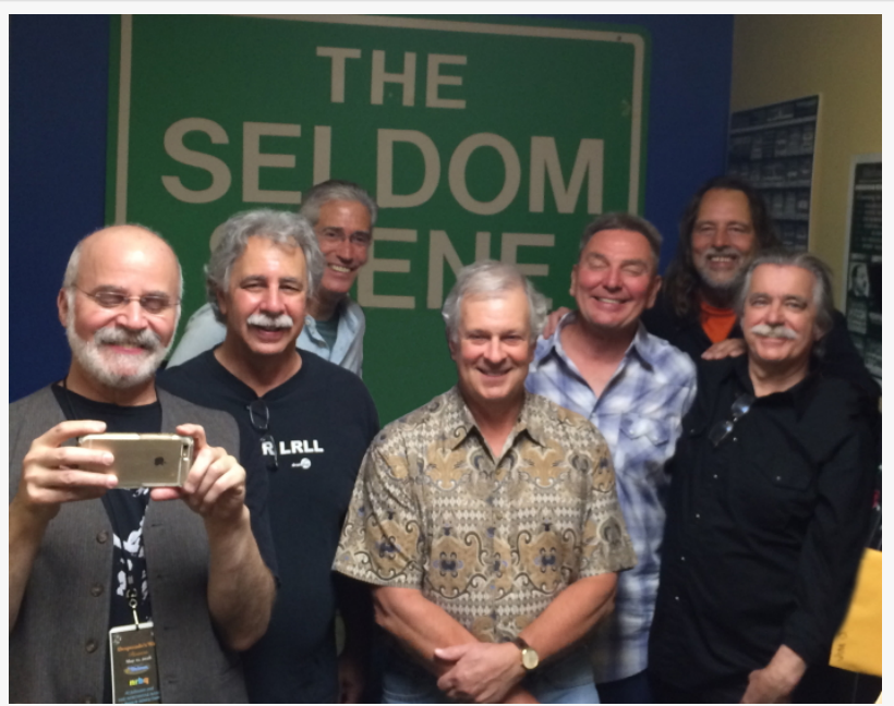
The North Star Band