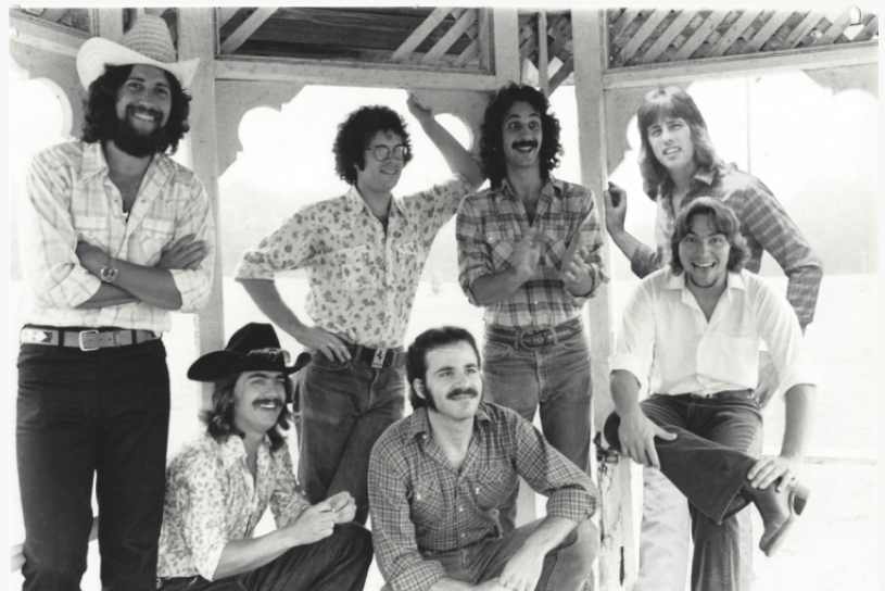
The North Star Band