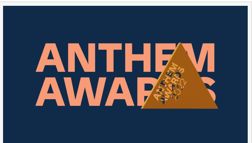
Anthem Awards 2022

The Anthem Awards was launched in response to the prevalence social good has taken within