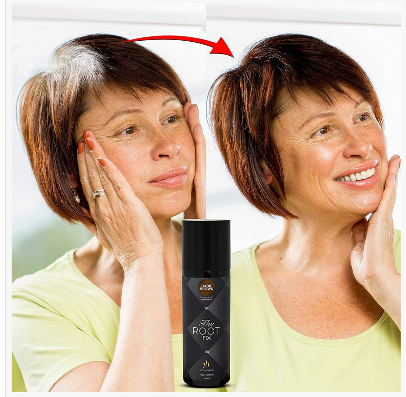
Touching Up Grey Root Regrowth