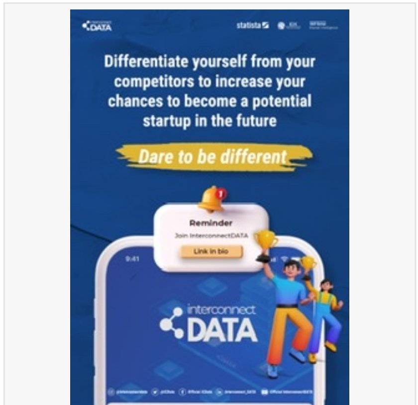
InterconnectDATA Business Intelligence Platform