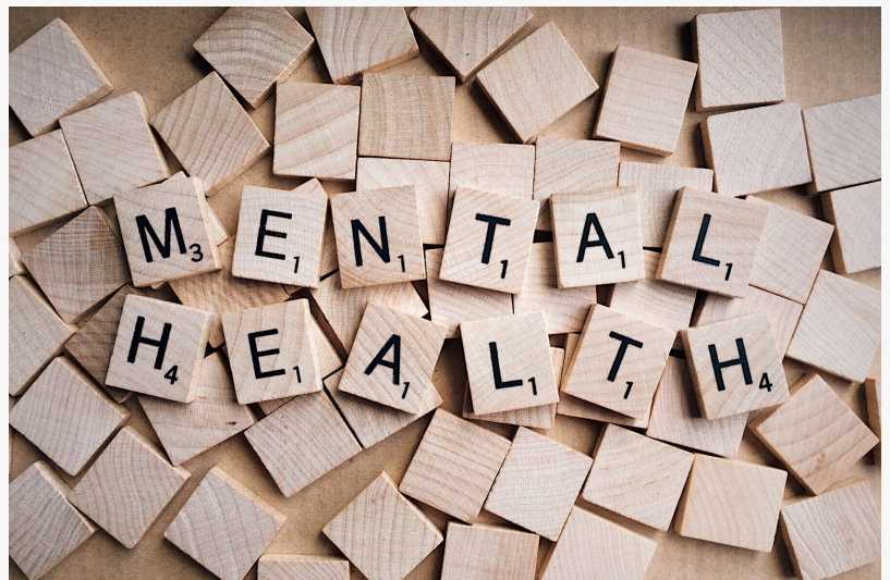
Alternative & Holistic Solutions