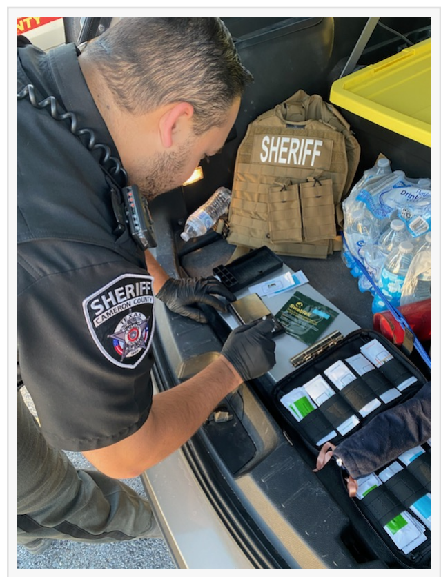
SwabTek deployed by Cameron County Sheriff

In a continued effort to support counter-narcotics efforts at the border, SwabTek will be in attendance at the Border Security Expo in San Antonio, TX, on