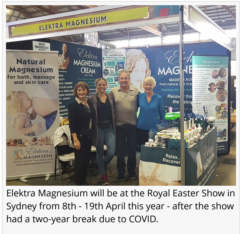
Elektra Magnesium will be at the Royal Easter Show in Sydney from 8th - 19th April this year - after the show had a two-year break due to COVID.

SYDNEY, NSW, AUSTRALIA, March 25, 2022 /EINPresswire.com/ -- Elektra Magnesium will be exhibiting at the 2022 Sydney Royal Easter Show from the 8th to the 19th April, after the show's two-year break due to COVID. At the Elektra stand, there'll be free demonstrations of 5-minute neck and shoulder massages using Elektra Magnesium products, so people can feel the difference transdermal magnesium makes to relax and soothe tight muscles, aches or pains.