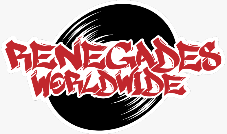
The Renegades Worldwide "LP" logo