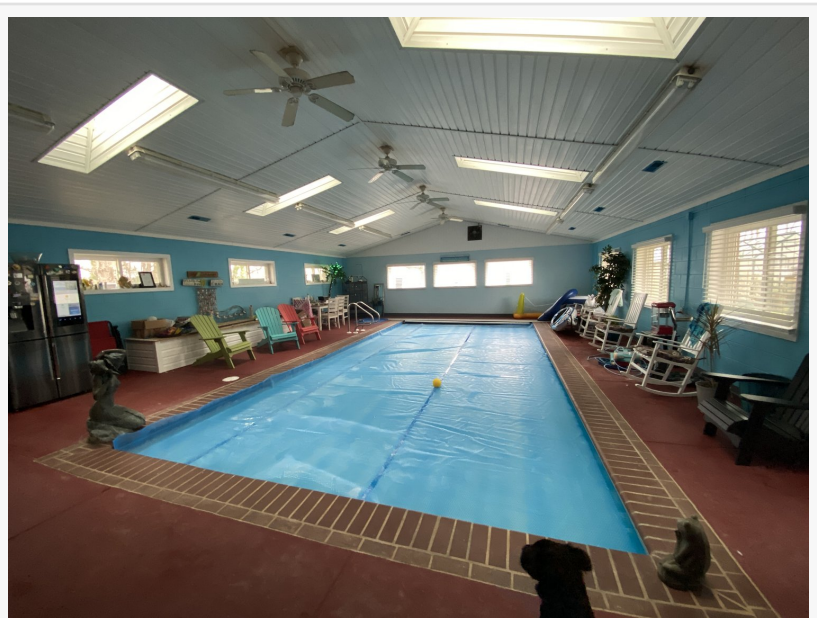
600 Fagan Dr., Fredericksburg, VA 22405