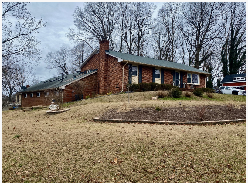
600 Fagan Dr., Fredericksburg, VA 22405