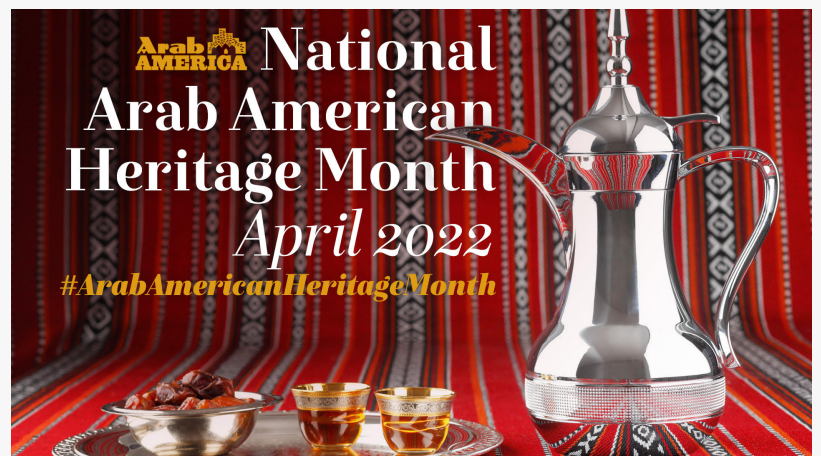
Arab Americans celebrate National Arab American Heritage Month in April 2022