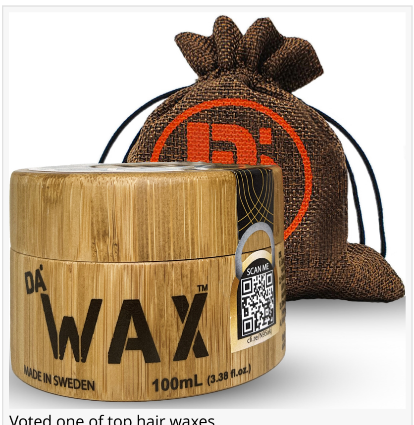
Voted one of top hair waxes

Another feature of the new design is the QR code. Customers can scan the code and connect to the subscription system. Subscribing means receiving valuable information about hairstyling. Such as hints and tips so they can look