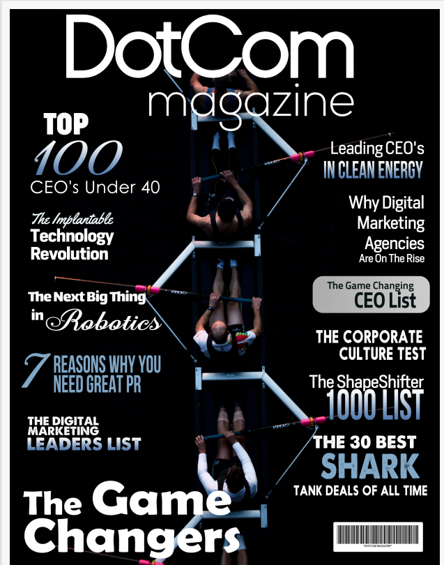
The DotCom Magazine Game Changers Edition