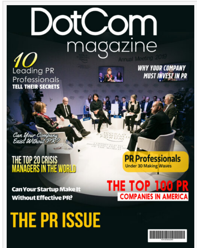
The DotCom Magazine PR Issue

DotCom Magazine is a leading news platform providing fascinating interviews with news makers, thought leaders, and entrepreneurs. DotCom Magazine is the leader in putting people with insatiable entrepreneurial spirit at the forefront of every story it covers. The Entrepreneur Spotlight Interview Video Series looks at business through the lens of a successful entrepreneur’s mindset. The Entrepreneur Spotlight Series has included high-profile leaders, including Inc 500 founders, Ted Talk presenters, ABC Shark Tank participants, venture backed visionaries, prolific CEO’s and Founders, and many other wonderful thought leaders and entrepreneurs. DotCom Magazine covers Founders and CEO’s making a difference. Regardless of who the entrepreneur is, where they live, or what they are doing, if it is interesting and newsworthy, DotCom Magazine covers it. In selecting entrepreneurs for this important video series, we consider the newsworthiness of the story and what our viewers want to learn about. If something is important to our viewers, it is important to DotCom Magazine. The people at DotCom Magazine believe in including a diverse range of entrepreneur voices in our interviews, and actively pursuing entrepreneurs making a positive difference in the world.