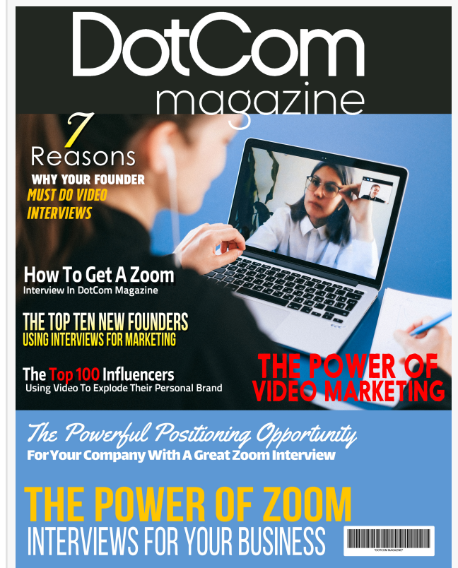
The Power Of Zoom Interview Issue