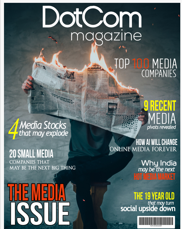
The DotCom Magazine Exclusive Entrepreneur Spotlight Series