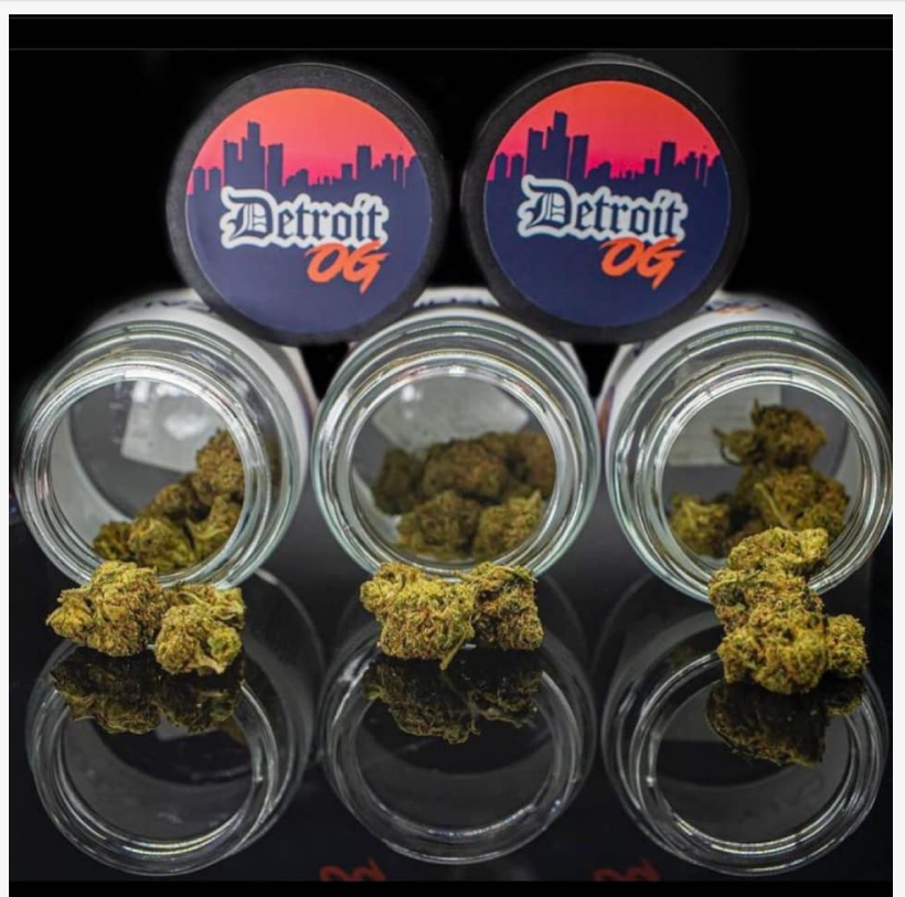
Detroit Grown Women Owned

This press release can be viewed online at: https://www.einpresswire.com/article/566443345