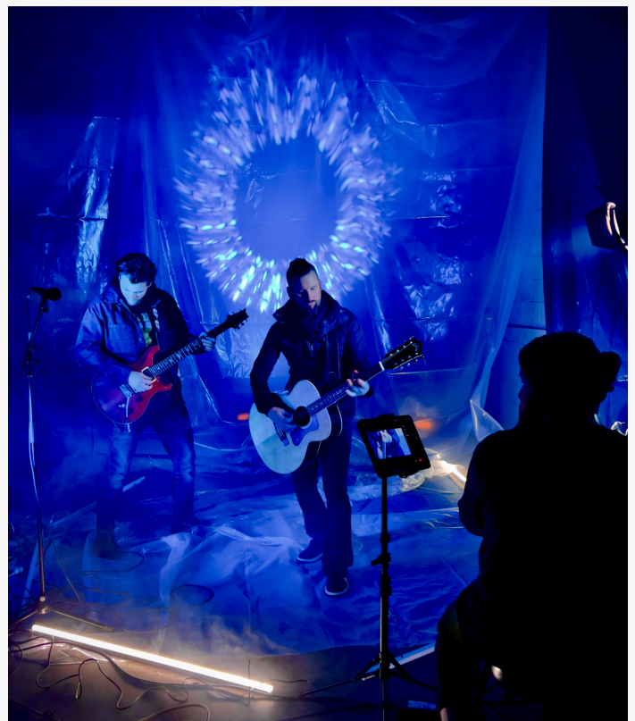
Deepfield Video Shoot