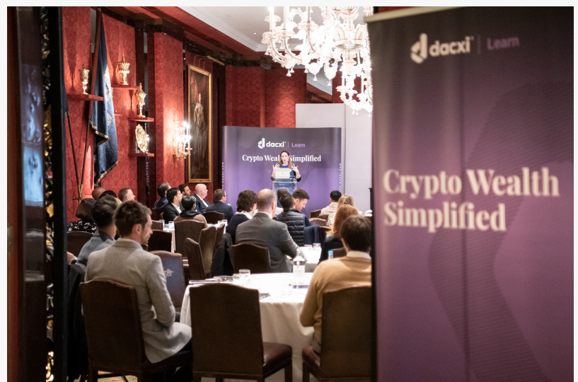
Fin Pro Event with Dacxi in London

If you are a financial professional and would like to visit the Dacxi CPD accredited course called 'Unlocking the Crypto Opportunity for Financial Professionals' then please register at https://learn.dacxi.com/finpro-registration/