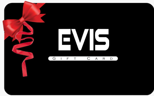
EVIS Gift Card