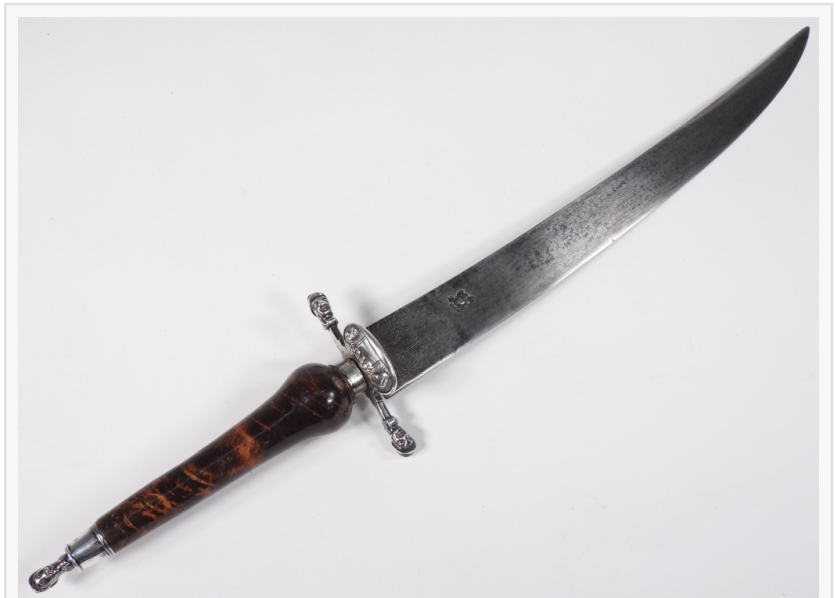
Silver mounted William & Mary plug bayonet (England, circa 1680-1700) having a half clam shell with busts of William & Mary on each side (est. $2,000-$3,000).