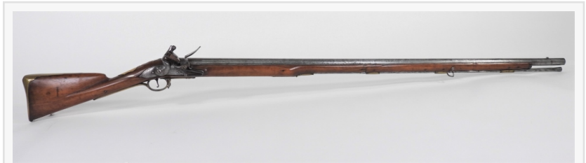
American-marked British pattern 1742 musket, made in England circa 1746, .79 bore with a walnut stock, overall 61 ¾ inches in length (est. $15,000-$20,000).

The sale will focus primarily on the French & Indian War, American Revolution, Civil War, World War I and II and modern firearms. Start time is 10 am Eastern.