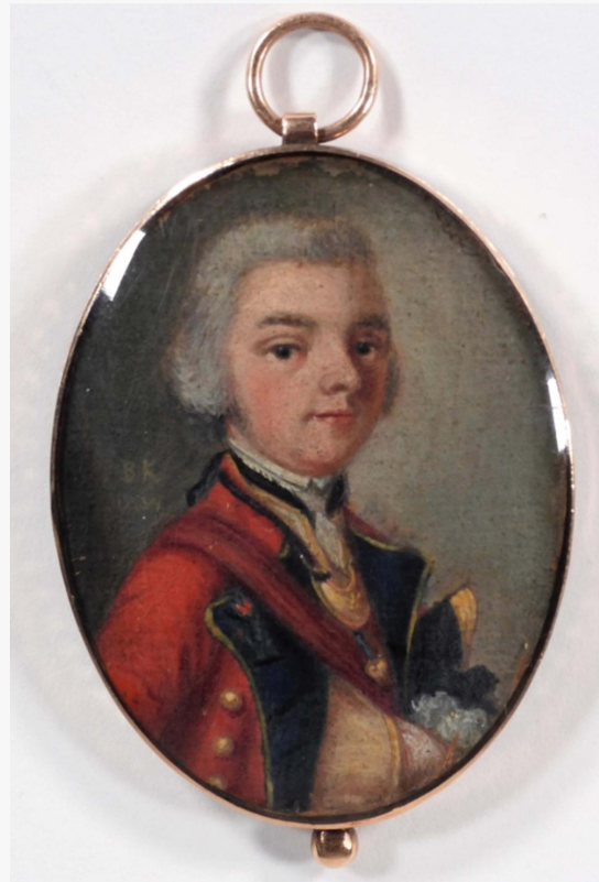
Miniature portrait of Lt. Steele of the Royal Welsh Fuzileers (England, circa 1764), just 2 \frac{1}{8} inches tall by 1 \frac{7}{16} inches wide, in a gold case (est. $2,000-$3,000).