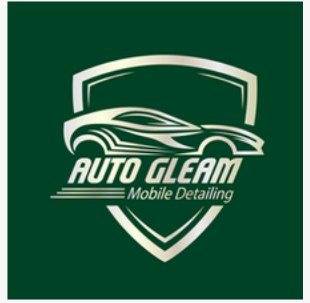
Logo of Auto gleam mobile detailing

This press release can be viewed online at: https://www.einpresswire.com/article/566586654