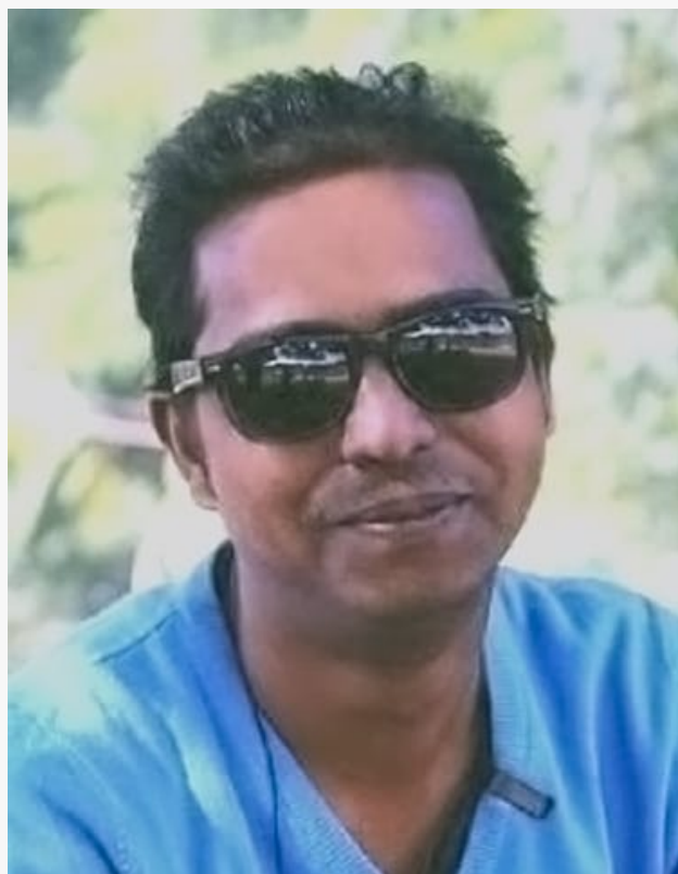
Remembering Artist Asit Roy

This press release can be viewed online at: https://www.einpresswire.com/article/566626206