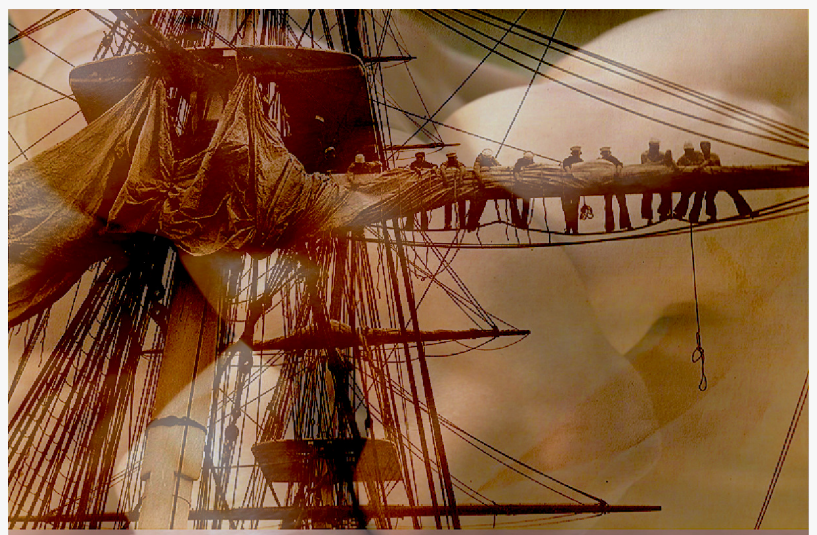
Giving a visual from to the metaverse

success in the metaverse. It is what connects to an audience in this fast-evolving tech space. Symbols speak louder than words and get retained longer in their mind. It is the creative minds that can provide an audience with something they can feel. 'Like entering a place called Vertigo