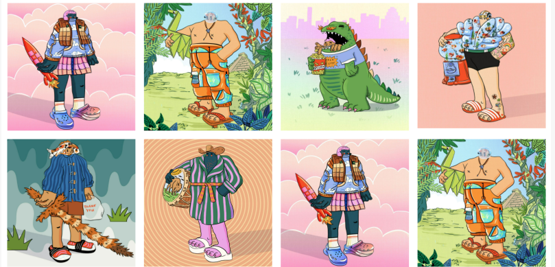
The Humanians sneak peak gallery