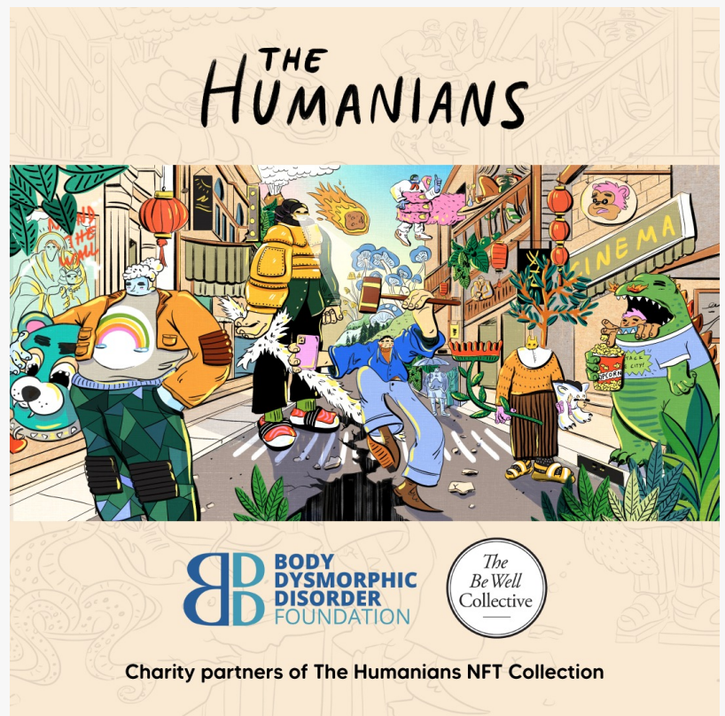
The Humanians Socially conscious NFT