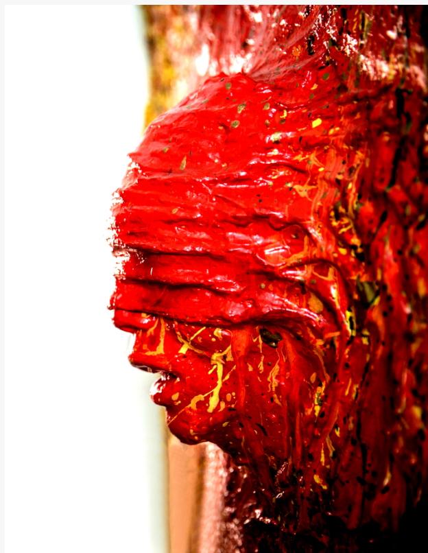
The Man Who Does not See A Version - Red Coloured Picture