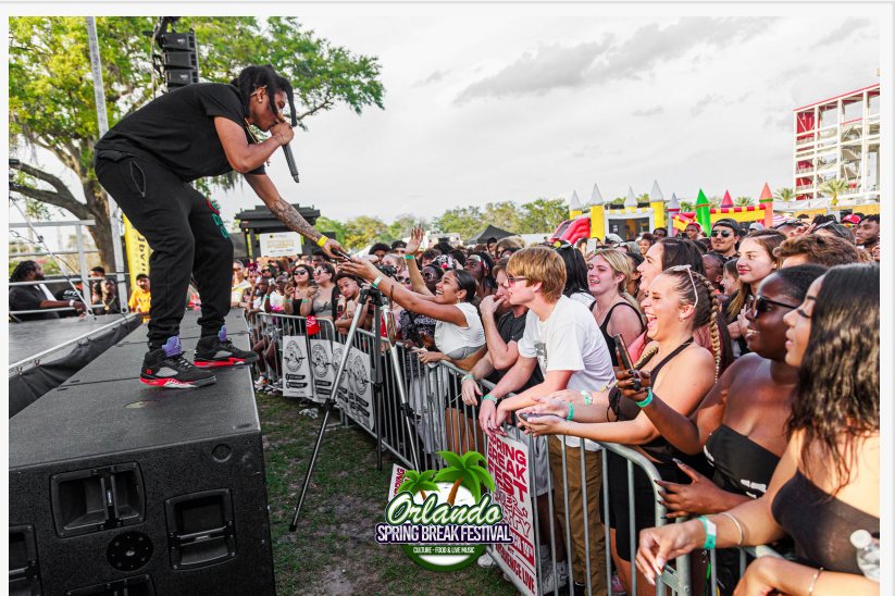
Orlando Spring Break crowd