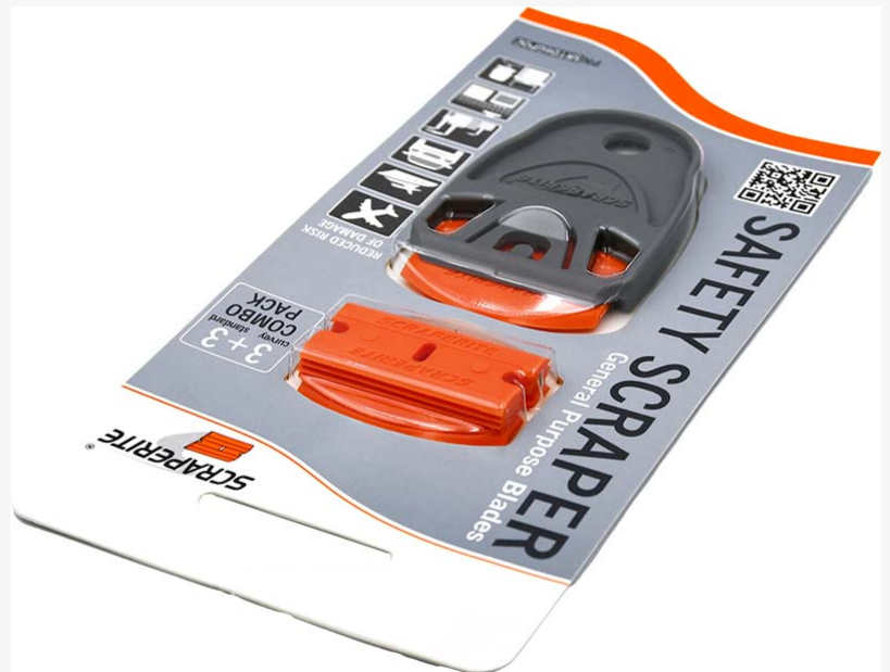
Scraperite trapped blister pack for plastic razor blades

Why does it matter? Scraperite offers new smart eco friendly packaging for plastic razor blades