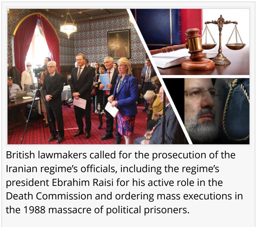
British lawmakers called for the prosecution of the Iranian regime's officials, including the regime's president Ebrahim Raisi for his active role in the Death Commission and ordering mass executions in the 1988 massacre of political prisoners.

In his speech, David Jones, MP and former Secretary of State for Wales and Minister for Brexit, commemorated the late Sir David Amess, a great friend of the Iranian Resistance and one of the oldest members of the UK Parliament.