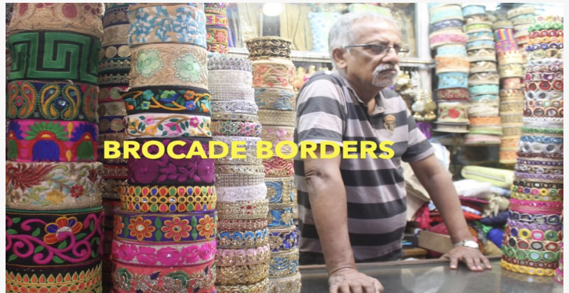
Brocade @New Market

As is well known, the English settled in India to trade in textiles. Till today, Kolkata boasts of some of the finest textiles in the world. The Dhakai muslin, Bengal cotton such as Jamdani & Tant( https://www.shopkhoj.com/clothing/tant-jamdani-dhakai-sarees/ ), Tussar fabrics ( https://www.shopkhoj.com/clothing/tussar-silk-sarees/ ) and Banarasi kora & silk ( https://www.shopkhoj.com/clothing/banarasi-sarees/ ) are stunningly beautiful fabrics. Saris & fabrics are readily available at the best sari shops, such as Priyo Gopal Bishoyi, ( https://www.shopkhoj.com/shops-in-kolkata/priya-gopal-bishoyi/ ) Adi Dhakeswari