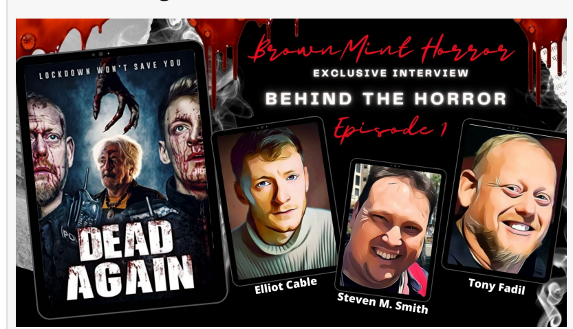
Brownmint Horror - Episode 1 - Dead Again