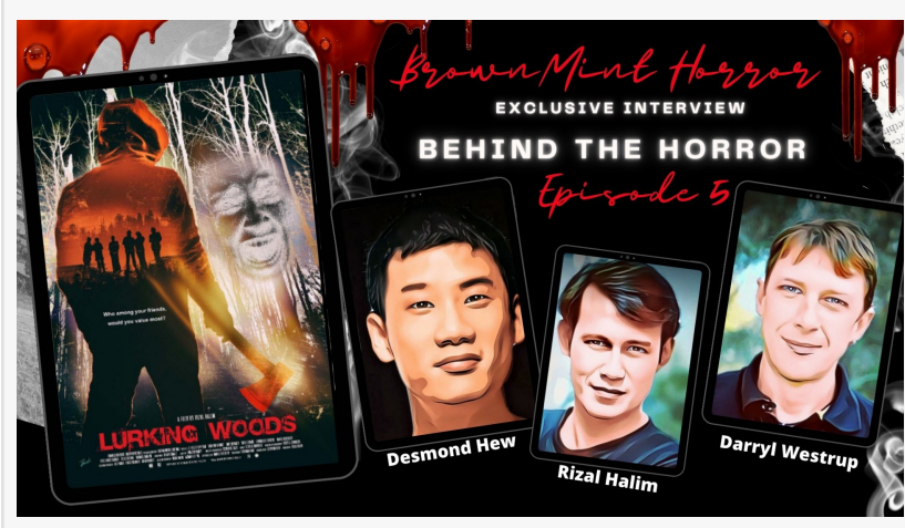
Brownmint Horror - Episode 5 - Lurking Woods