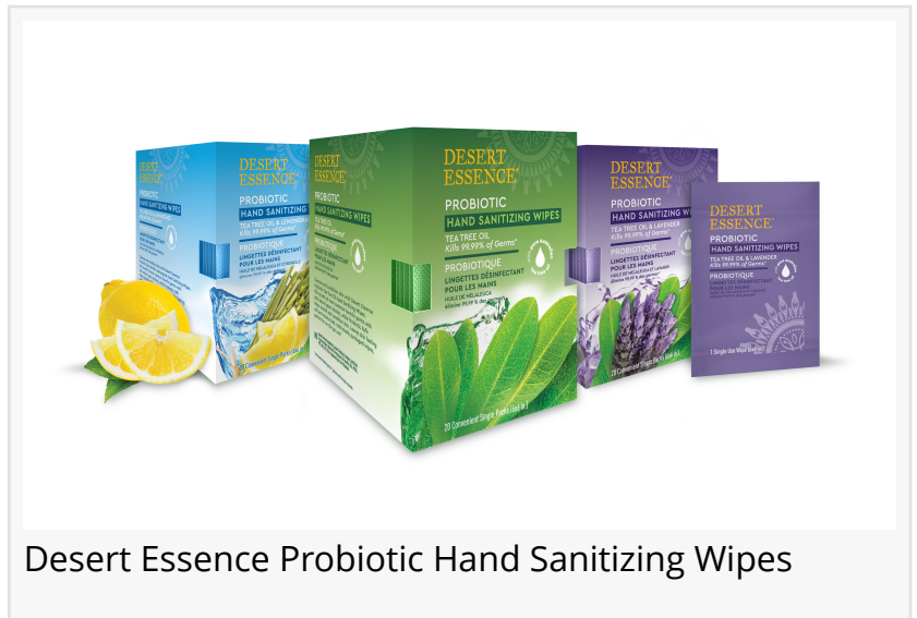
Desert Essence Probiotic Hand Sanitizing Wipes

draws its inspiration and ingredients from the desert, “a model of pristine balance and sustainability, where limited resources, if used responsibly, offer the body and spirit untold benefits.” Using nutrient-rich desert botanicals revered in native cultures for their healing properties, like Tea Tree, Jojoba, Aloe, and Argan Oils, Desert Essence’s body, skin, and hair care products work in harmony with the body to soothe, nurture, and restore. True to its principle, the company works to ensure that both its products and practices reflect the serious commitment it has made to the health of the planet. Desert Essence is a Certified B-corp Corporation.