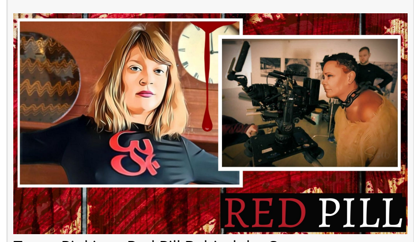
Tonya Pinkins - Red Pill Behind the Scenes