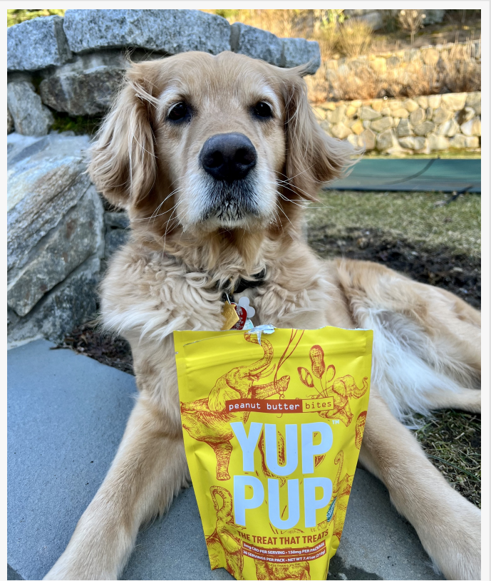
YUP PUP Furry-Founder - Zezu

YUP PUP™ is an all-natural, hemp-derived CBD dog treat company. With a mission to create healthy treats on par with the clean, healthy food humans eat. YUP PUP™ treats are made with simple ingredients that help to promote joint mobility, relieve anxiety, and ease digestion. To learn more visit https://yuppup.shop .