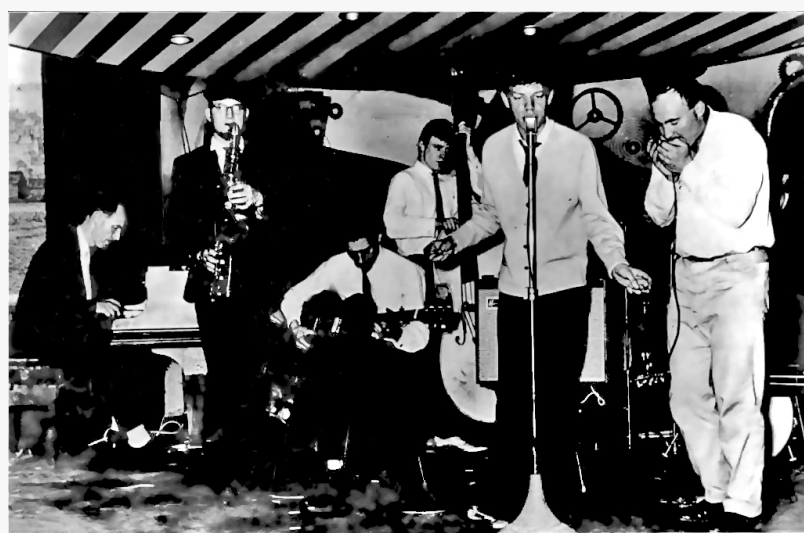
Mick Jagger sings with Blues Incorporated at the Marquee club