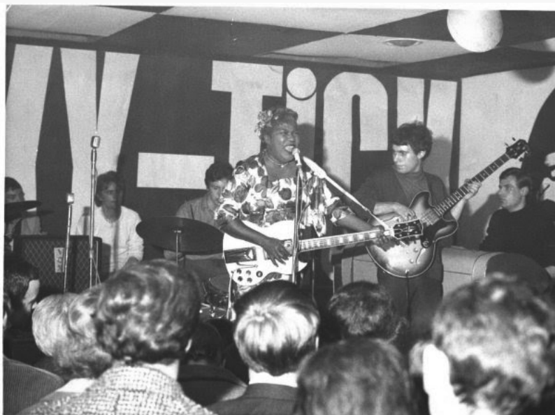
Sister Rosetta Tharpe plays the Ricky Tick club