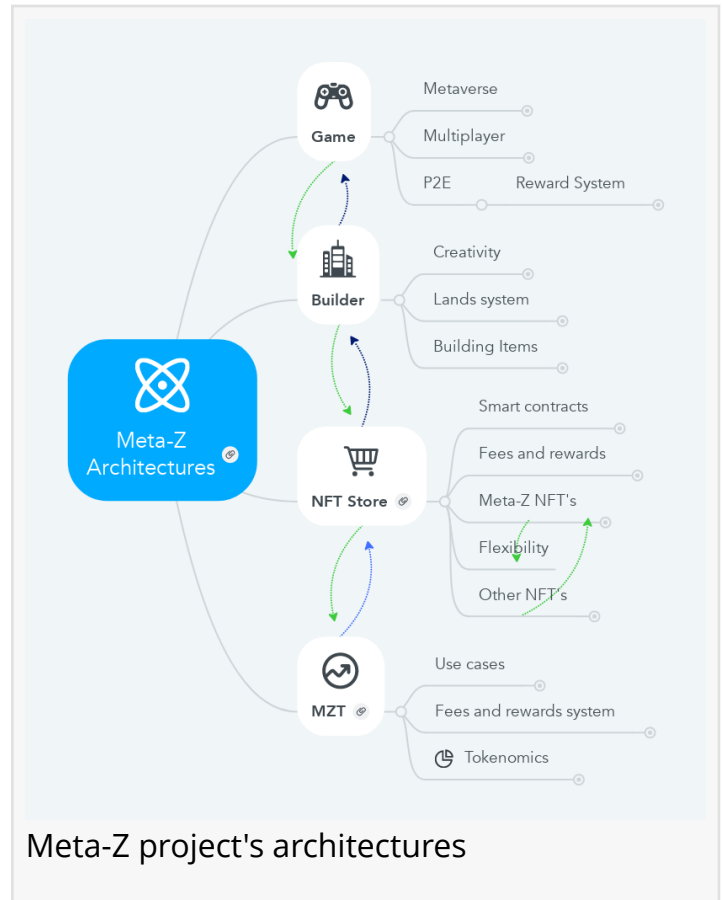
Meta-Z project's architectures

You can join MZT profitable staking pool and Share a reward pool of 20,000,000 MZT following few easy steps: