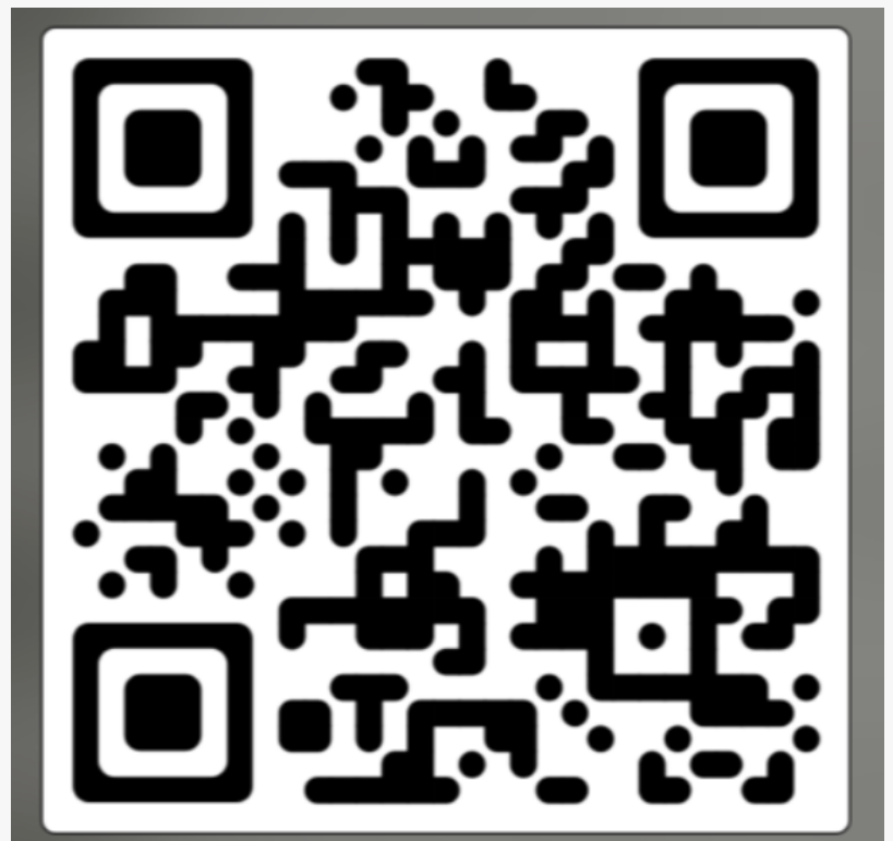
Scan the QR to launch an Augmented Reality Experience